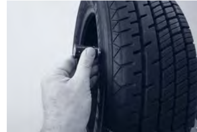
Fig. 5: Measurement of the rubber thickness outside on the sidewall up to the steel carcass (max. 6.5 mm) with probe F10-1.