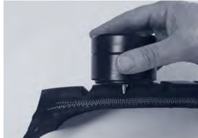
Fig. 4: Measurement of the under-tread thickness in the grooves of the tread up to the steel mesh (max. 10 mm) with probe F 30-T and steel pin.