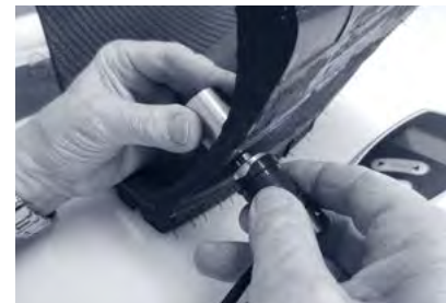
Fig. 8: Measurement of total rubber thickness of the side wall with fabric carcass (max. 10 mm) with probe F10-cp and Fe counter pole.