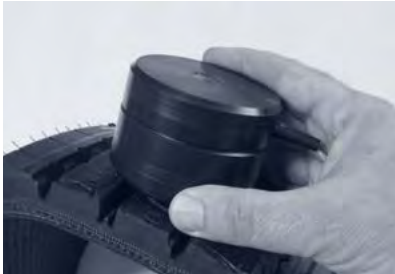
Fig. 3: Measurement of the rubber thickness on the running surface up to the steel mesh (max. 30 mm) with probe F 30-T.