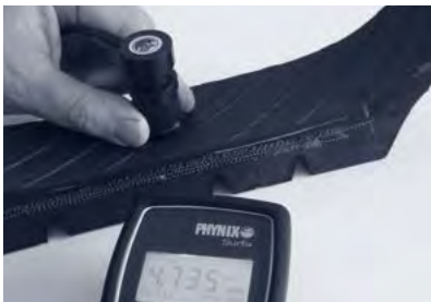
Fig. 6: Measurement of the rubber thickness inside beneath the tread up to the steel mesh (max. 6.5 mm) with probe F10-2.