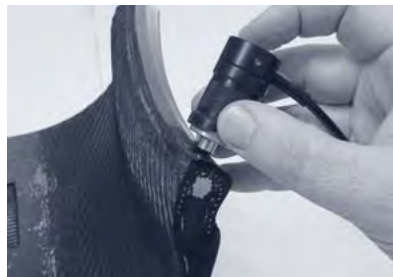
Fig. 7: Measurement of rubber thickness on the bead up to the steel mesh (max. 6.5 mm) with probe F10-3.