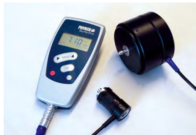
Fig.2: Coating thickness gauge Surfix® Pro S-CT with probes F 30-T and F10

Gauge Surfix® Pro S-CT with rubber protective cover, calibration standard(s), probe(s) according to order, two AA batteries, data transfer program, instruction manuals and manufacturer's certificate, all in a rugged plastic carrying case, the probe F 30-T is delivered in a soft carrying pouch.