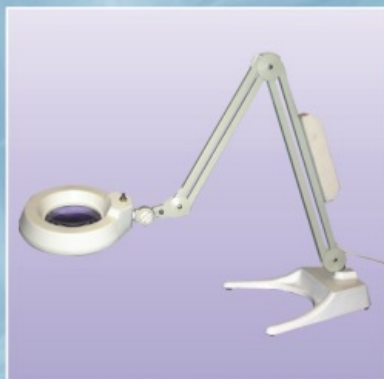
SEMI DELUXE MODEL