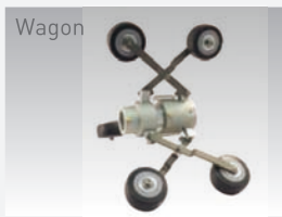
Wagon ø150mm ~ 300mm

Centering device's external diameter is 50mm, 100mm and 150mm. They can be attached to camera head easily and reliably. The camera head can be centered in the pipe with specific pipe diameter.