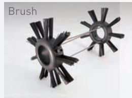
Brush ø150 or ø100